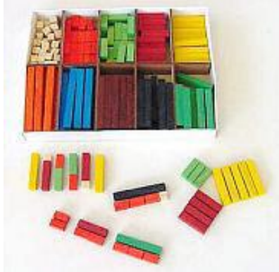
(A) Cuisenaire rods

(fractions and proportions), golden blocks (Fig. 1B) (decimal system) amongst others, to stimulate children to express themselves through perceptual-motor activities, and language and play (Colella, 2000).